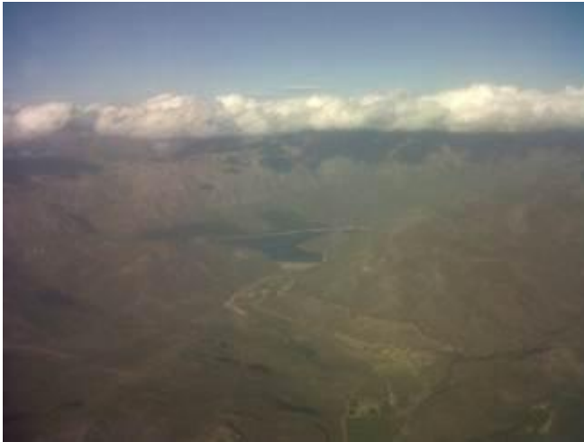
Wemmershoek Dam on my right (Centre of Picture)

After tuning at Renosterhoek, the return flight south to Rooiels goes without problems, and I arrive again at 1000ft over the sea. Here I have to hurry as the cloud-base has begun to descend over the Hottentot Holland mountains due to the humidity of the air. In fact I am unable to