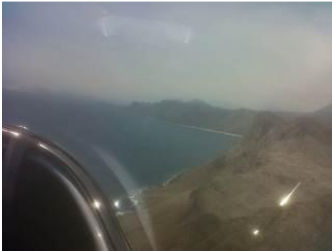
North from Rooiels

At last the wind increases, which is visible on the surfaces of the dams below, so I push the speed up significantly. At Paarl I have to decrease the speed again in order to climb without thermaling, before heading across the