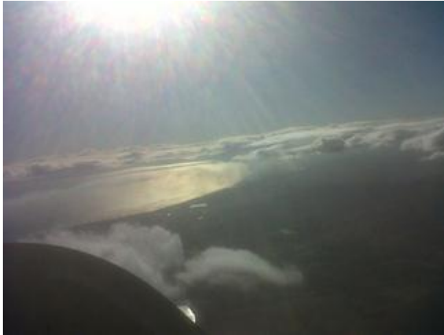
False Bay in full view ahead

There can be few places in the world that offer the opportunity to soar from rugged inland mountains to equally breath-taking coastal scenery, and then back again to the point of departure. Here on the south western tip of Africa, soaring conditions sometimes allow for just such flights.