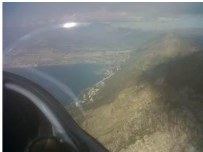
Approaching Gordons Bay from the South

With good speed I pass Dasklip for the second time, where the conditions become weaker, as they often do. The original goal had been to climb during the next 20km northward, then cross east to the Cedarberg and continue to the town of Klaver as the northernmost turn point. However, due to the weak conditions, the third turnpoint has to be cut short to Renosterhoek once more.